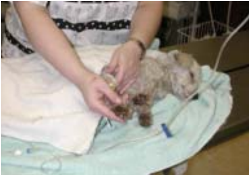
Bichon Troy receiving medical care funded by Small Paws® Rescue

☑ Small Paws® Rescue has rescued, vetted, and rehomed over 4,500 Bichons since its inception in September of 1998.